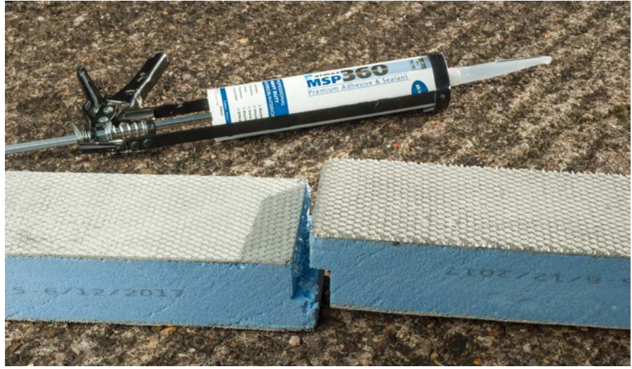
Remark: As a part of our policy of on-going product development and testing, we reserve the right to modify, alter or change product specifications without giving notice. All information contained in this document is given in good faith and is provided for guidance only. Any drawings provided are for illustrative purposes only. As Marmox (UK) Ltd has no control over the methods or competence of installation and of prevailing site conditions, no warranties, expressed or implied, are intended to be given as to the actual performance of the product mentioned or referred to herein and no liability whatsoever will be accepted for any loss, damage or injury arising from the use of the information given.